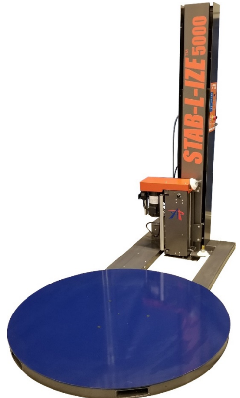
All dimensions are approximate.