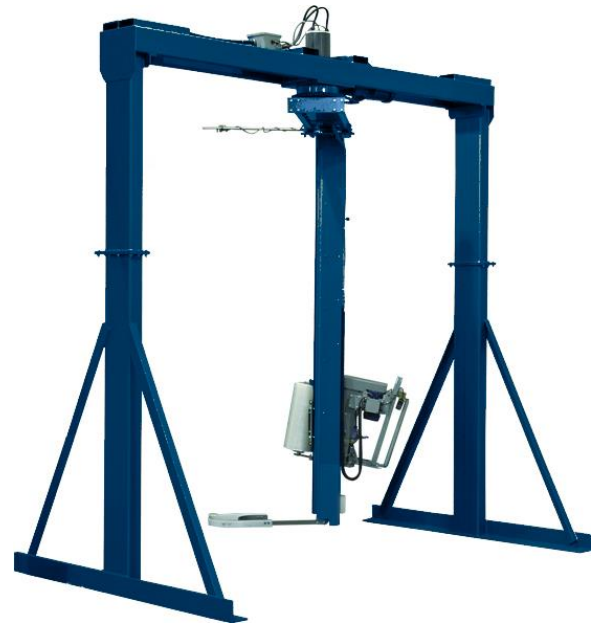
All dimensions are approximate.